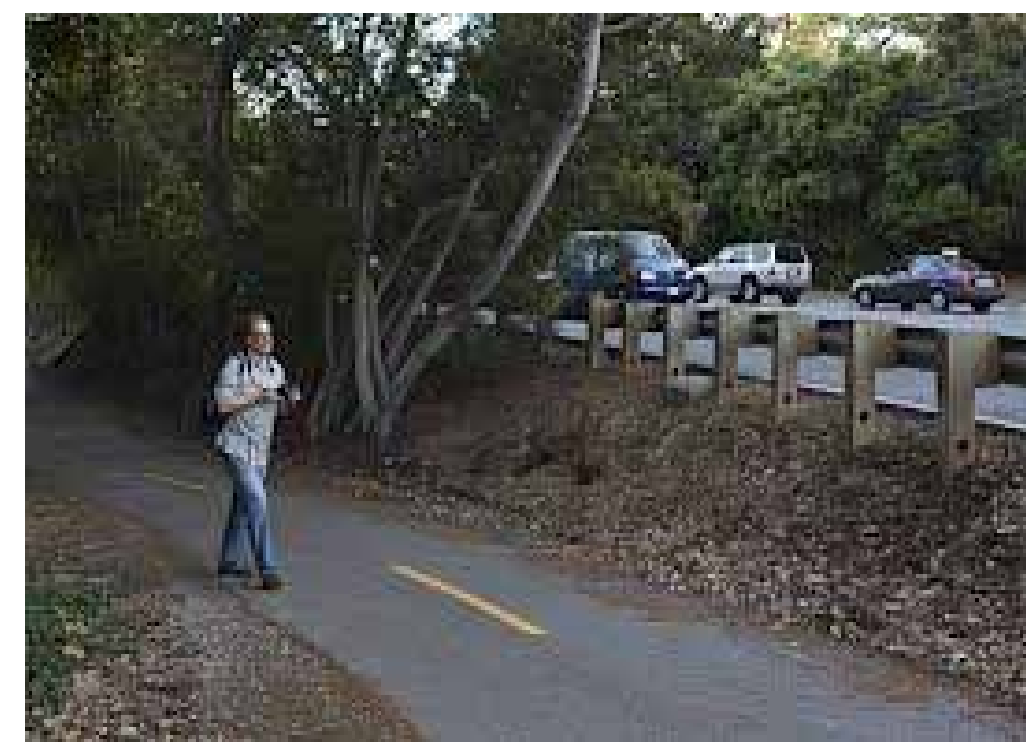
Walking trails along Old Hwy 53 (from Bed & Breakfast area to Olympic corridor)