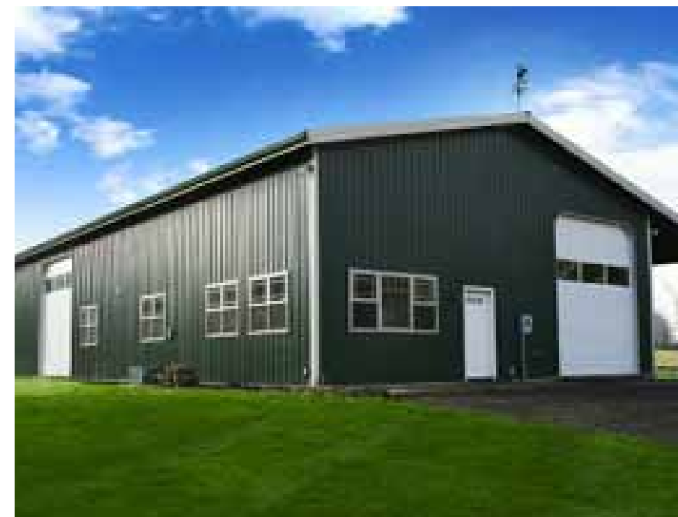
Light industry north of Ogulin Canyon