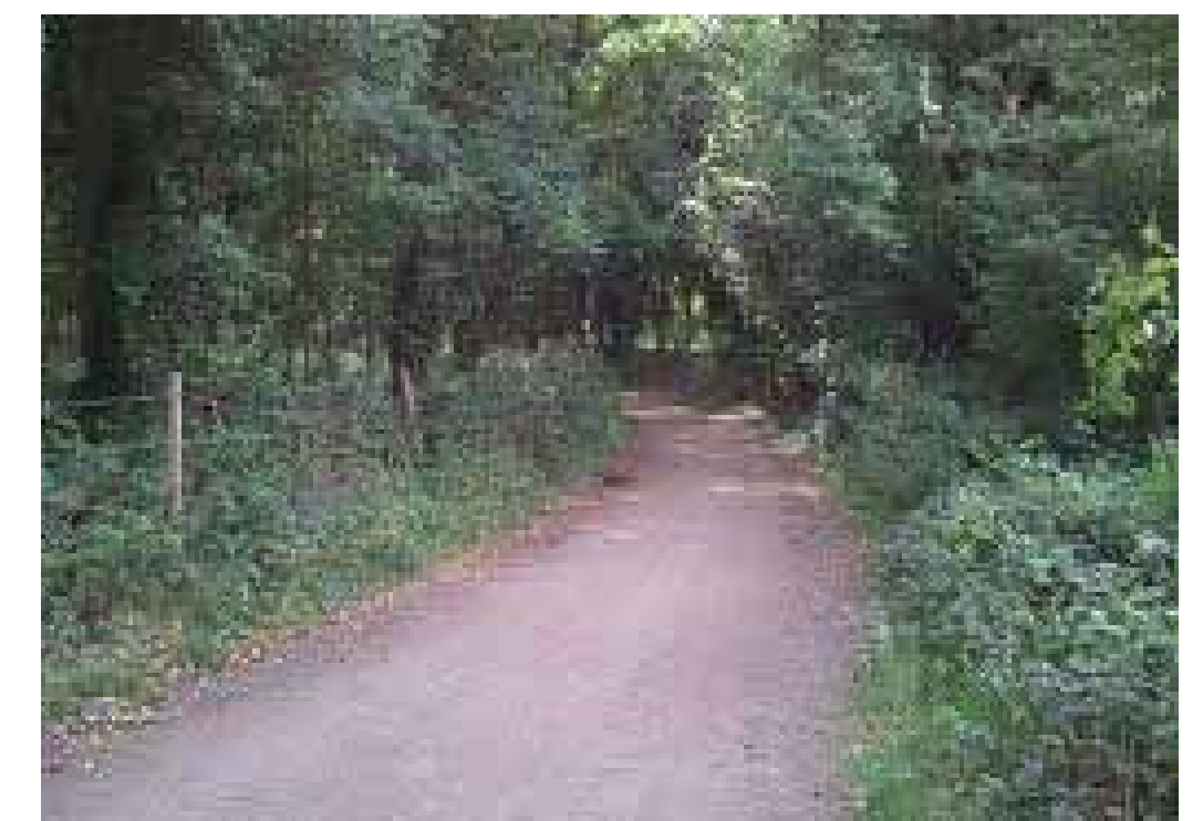
Open nature trails