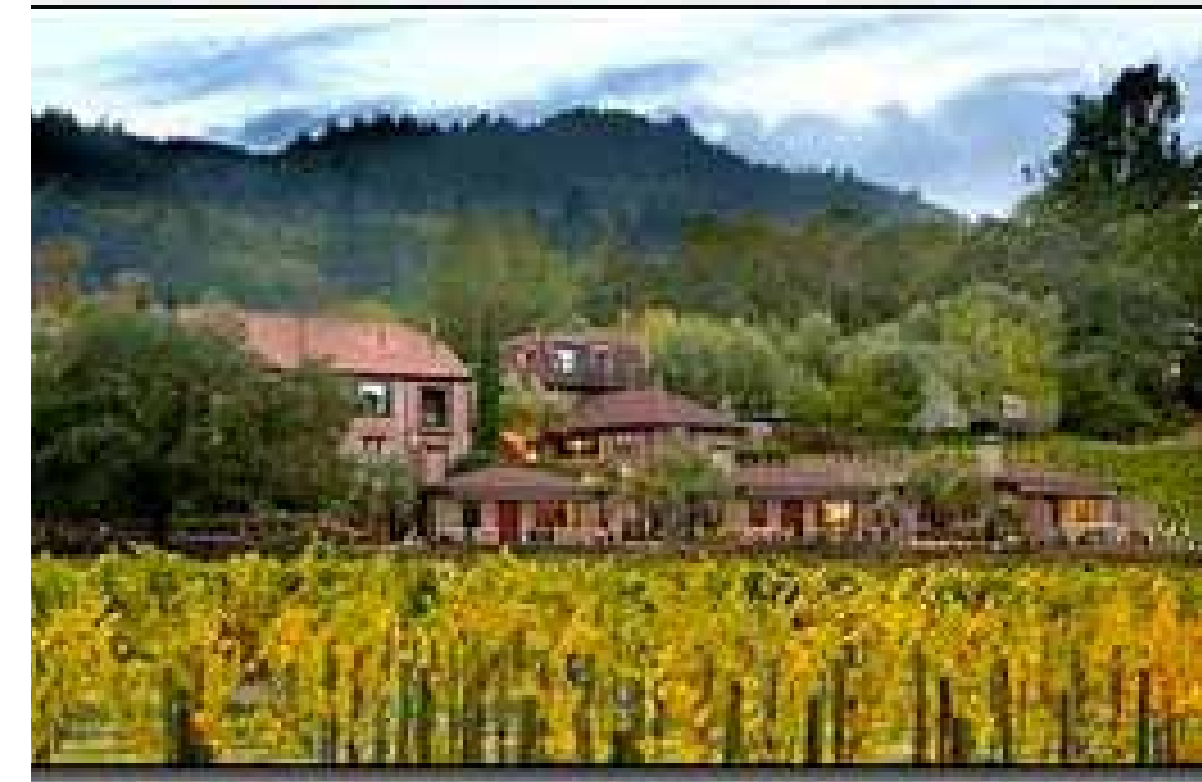
Bed & Breakfast with rolling vineyards