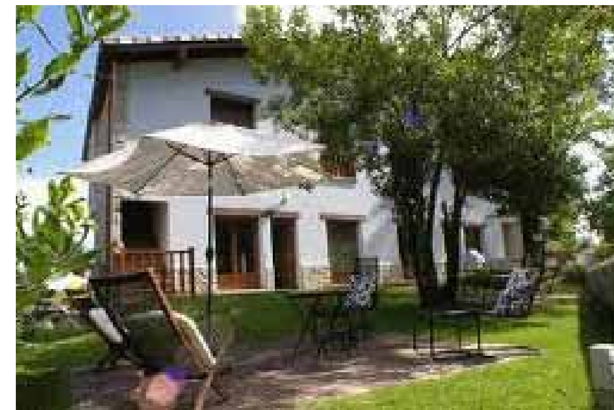
Relaxing atmosphere for tourists