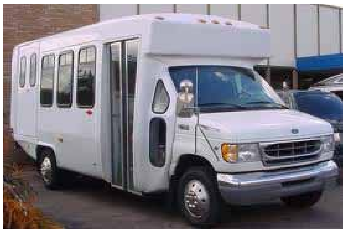
Service shuttle connecting Bed & Breakfast area to Downtown