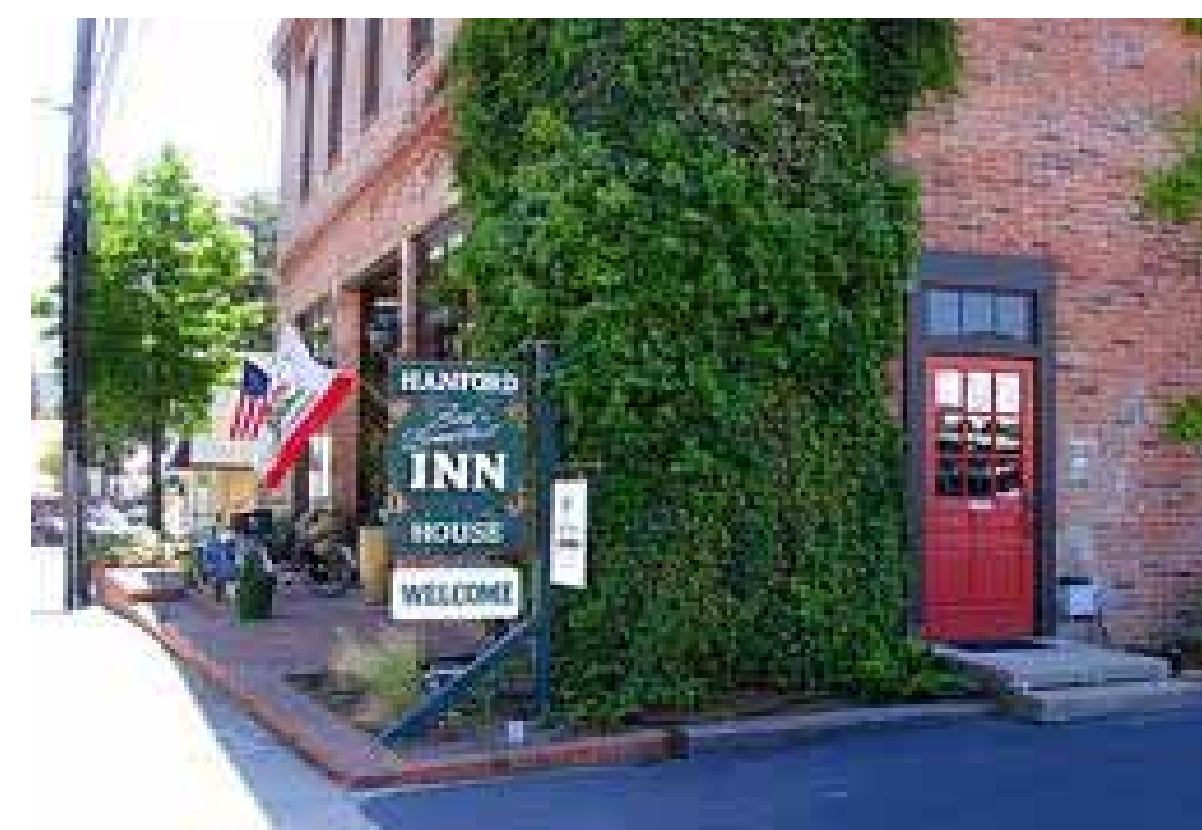
Wine & retail service focused industry